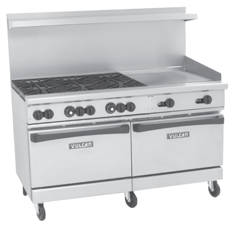
Model G60SS-6FT24 shown with optional casters